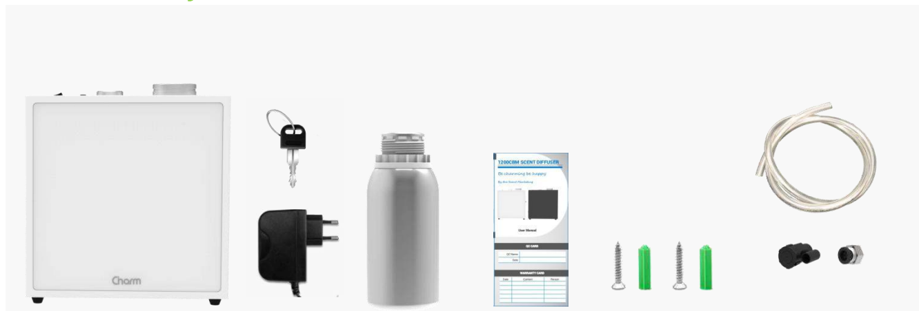
Charm Aroma Diffuser